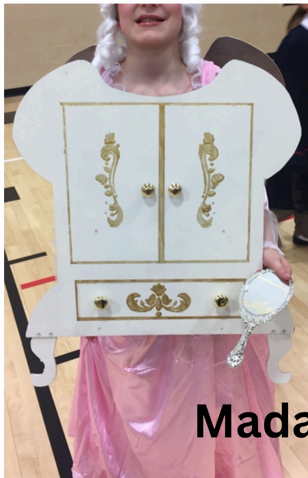
Madame Grande Bouche