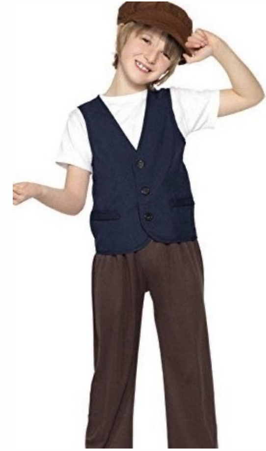
Male Villagers, LeFou, Maurice, Monsieur DeArgue